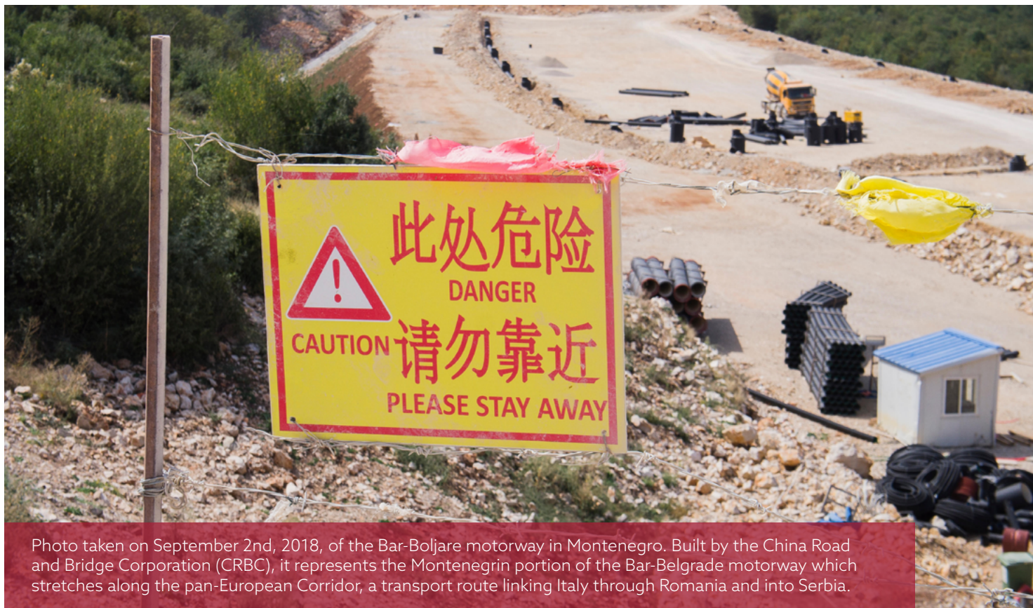
Photo taken on September 2nd, 2018, of the Bar-Boljare motorway in Montenegro. Built by the China Road and Bridge Corporation (CRBC), it represents the Montenegrin portion of the Bar-Belgrade motorway which stretches along the pan-European Corridor, a transport route linking Italy through Romania and into Serbia.

Although there are no official reports of corrupt practices involving Chinese officials or entities associated with the Bar-Boljare highway project, media sources and civil society organizations (CSOs) have raised concerns about the lack of transparency in planning and contracting, as well as the fact that figures with close ties to President Djukanovic appear to have been awarded contracts related to the project. 134 For example, the large Montenegrin contractor Bemax, controlled by close associates of Djukanovic, has been paid $105 million for work on the highway. 135 Since the government designated most of the documents associated with the highway's design as secret, the public has been unable to subject these dealings to proper scrutiny. 136