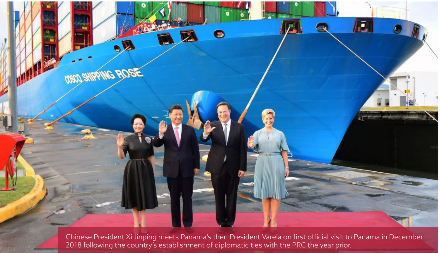
Chinese President Xi Jinping meets Panama's then President Varela on first official visit to Panama in December 2018 following the country's establishment of diplomatic ties with the PRC the year prior.

confidence in democratic leaders and institutions. This dynamic is a buoy for China's effort to cast doubt on the efficacy of democracy and legitimize its illiberal governance model.