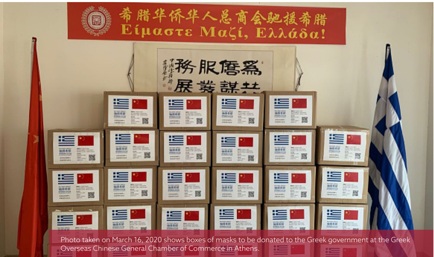
Photo taken on March 16, 2020 shows boxes of masks to be donated to the Greek government at the Greek Overseas Chinese General Chamber of Commerce in Athens.

COSCO-owned shipyard that would supplant local businesses, and claim that COSCO has intentionally neglected to maintain the Independent Ship Repair Zone's infrastructure. 272 The evidence suggests that COSCO is not interested in developing areas beyond the container terminals, skewing the terms of the COSCO-PPA arrangement in favor of Chinese interests. (For example, the Ship Repair Zone's employment potential is constrained by the fact that it does not service COSCO container ships.) 273 If COSCO is able to successfully supplant the Independent Ship Repair Zone, it will improve its ability to service its own ships and potentially enhance the port's dual-use capabilities.