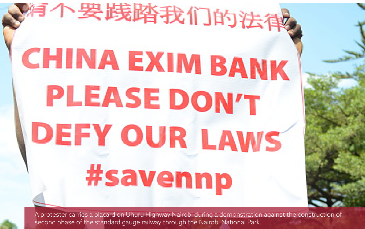
A protester carries a placard on Uhuru Highway Nairobi during a demonstration against the construction of second phase of the standard gauge railway through the Nairobi National Park.

SGR and other infrastructural projects. 52 Kenyan Treasury data show that loan payments to the Exim Bank of China are expected to increase to $840 million for the 2020–2021 and $1.1 billion for the 2021–2022 fiscal years. 53 In 2019, Beijing received 87 percent of Kenya's total interest payments to its bilateral lenders, compared with 81 percent a year earlier, accounting for 66 percent of Kenya's bilateral debt. 54