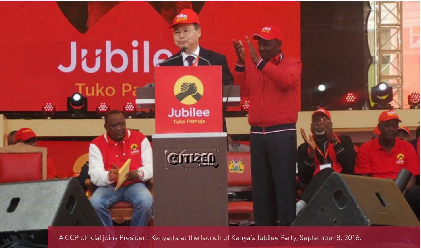
A CCP official joins President Kenyatta at the launch of Kenya's Jubilee Party, September 8, 2016.

exclusive control of news on China routed to prominent newspapers, government agencies and community networks. This effect is most pronounced where Chinese-government-linked enterprises have established dominant control over telecommunications infrastructure such as digital television, effectively becoming information gatekeepers by providing preferential broadcasting access to state media and friendly news sources while obstructing Western portals and critical voices.