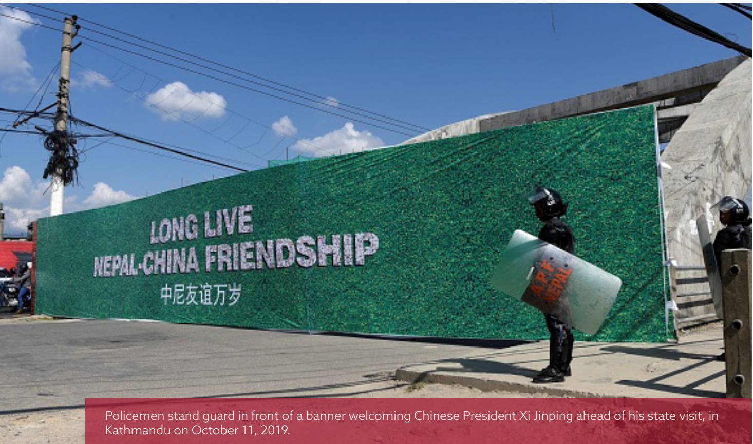
Policemen stand guard in front of a banner welcoming Chinese President Xi Jinping ahead of his state visit, in Kathmandu on October 11, 2019.