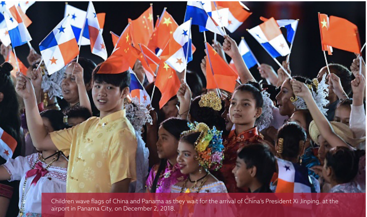
Children wave flags of China and Panama as they wait for the arrival of China's President Xi Jinping, at the airport in Panama City, on December 2, 2018.

Beijing's interests. Influential individuals with direct connections to Beijing have been appointed to key advisory positions in the Panamanian government. The former Varela administration established the National Council of Ethnic Chinese in 2015 and appointed community leaders to advisory roles to improve the government's responsiveness to the diaspora community. Four of six individuals appointed had ties to the UFWD. 175 In an open acknowledgement of the political utility of united front work in Panama, these individuals were awarded the highest honor by the UFWD for their role in facilitating Panama's shift in diplomatic recognition. 176